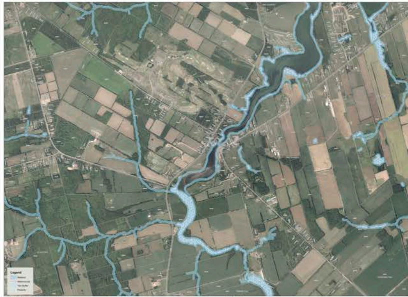
Aerial image (ARCGIS) showing areas of ecological features, wetland (blue stipple), watercourse/shoreline (dark blue line), 15 m buffer zone around water courses/wetlands (light blue band).