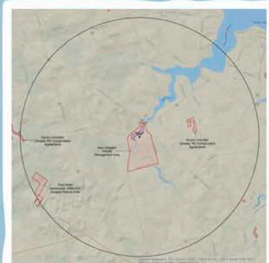
Boundaries and/or locations of known Managed and Significant Areas within the study area.

One of The River Clyde Pageant's core values is 'care for place', which means that everything we do is informed by environmental sustainability and stewardship. We envision a cultural hub that sits at the intersection of art and ecology and provides a way for New Glasgow residents, the Pageant community and visitors to make deep connections to this land.