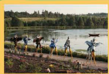
River Clyde Pageant, 2017