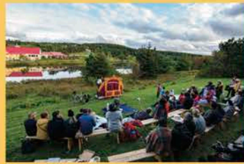
Sharing the Field, 2021