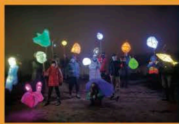
Solstice Walk, 2020