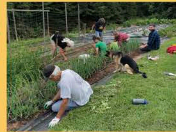
Pageant Community Garden, 2022