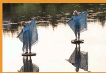
River Clyde Pageant, 2018