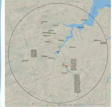
Known observations of rare and/or protected flora and fauna within the study area.